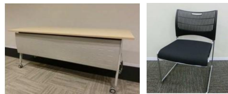
▲Supplementary image of fixtures